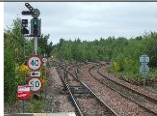
15 Ladybank Junction signal EB657- Up/Down Fife sweeps off to the right along with the DGL. Newburgh line straight ahead showing the loop points