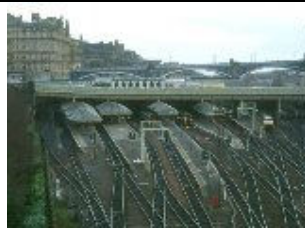
2 Waverley West End from above Mound Tunnel in 1997