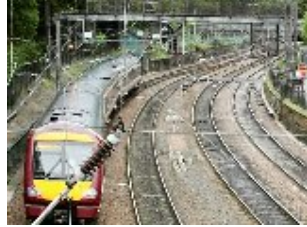
3 Princes St Gardens in 2008, class 170 DMU signalled UN to line Y at signal E504