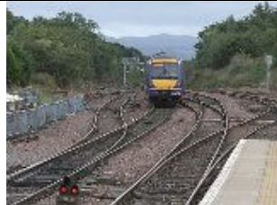
7 Dalmeny and signal EY958 in 2008