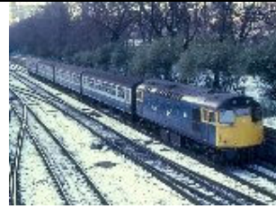
4 Class 27 passing through Princes St Gardens on a Dundee - Edinburgh train, January 1985