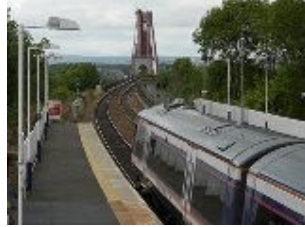
5 Forth Bridge seen from Dalmeny station in 2008. Signals EY661 and EY663