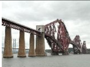
8 Forth Bridge from the southern shore of the Forth in 2008