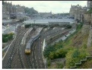
1 Waverley East End, class 305 EMU departing for North Berwick in 1994. Of note Motorail vans in the sidings.