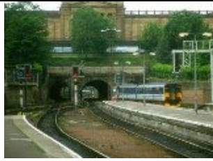
1 View from P12 through Mound Tunnels into Princes St Gardens in 1996. Class 150 DMU departing for Fife.