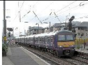
11 Haymarket looking west from P4 in 2008. EH511 showing the route to Slateford as a Glasgow Central - North Berwick class 322 EMU arrives into P3