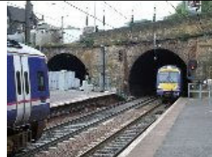
10 Haymarket P4 with trains on the South lines in 2008, EH510 and EH538 signals