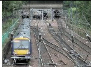
12 Princes St Gardens in 2008, class 170 DMU on line Z