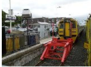
4 Bathgate in August 2008. This station will be relocated (yet again!) when the line to Airdrie opens