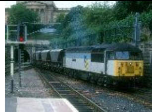
14 Coal for Cockenzie passing through Edinburgh Waverley in September 1996. Coal trains ran through Waverley for several years following a fire which damaged signalling equipment at Haymarket West Jn.