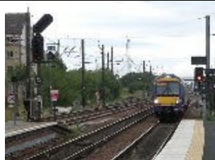
9 Haymarket looking west from P1 in 2008. EH513 and EH515 signals