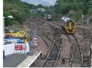
6 Dalmeny loops and junction, Forth Bridge workshop to the left in 2008. The far train is an ECS working via Dalmeny and Winchburgh Jns