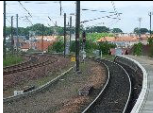
16 Dunbar station with ED495 (L) and ED497 (R).