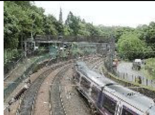
13 Princes St Gardens in 2008, class 170 DMU signalled US to line X at signal E502